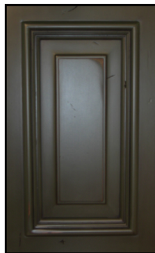
Jay Rambo's new Vintage Green finish on the Charleston door style.

In keeping with the green movement, there is a trend in interior design of using colors and materials that reflect nature. We are seeing a lot of green shades used in