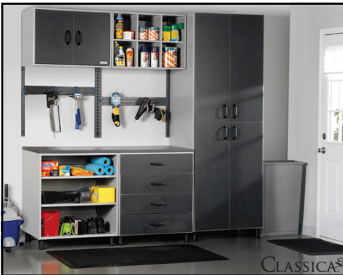
Schulte's storage options include special units to organize your garage.

CSI is excited to offer Schulte Strong Home Storage to our family of products. This affordable line of cabinetry for closets, pantries, garages, and other areas of your home is attractive and very versatile.