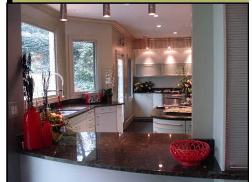
Reflecting the colors of nature, this cool kitchen is serene and well-equipped.

We have recently expanded and updated our web site. Take a look at www.csikitchenandbath.com for news, information, and lots of pictures of our projects!