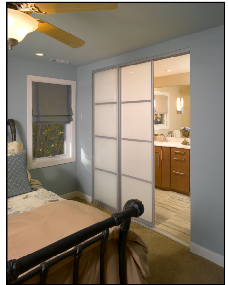
Bour bath won the award for Best Bath Remodel between $40-60K.

into a elegant contemporary guest bath. A custom vanity of zebra-wood holds a stainless vessel sink and leads to the doorless shower behind it. Note the huge rain-shower on the ceiling.