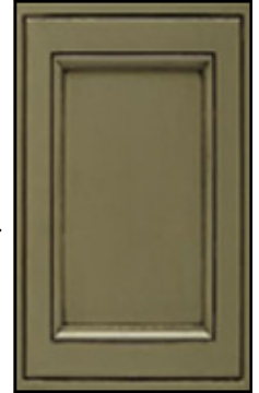
Schrock's Moss finish on the Brantley door.

Schrock's green offering is a lighter green shade called Moss, also with glazing, available on all their maple door styles (except Prestley).